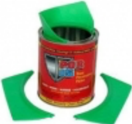
POR 15 PAINT SPOUT-PS50