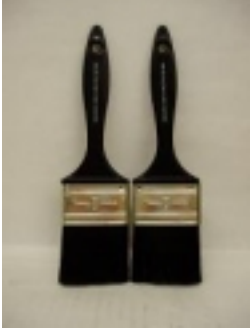
2" 100% Polyester Paint Brush 388-694