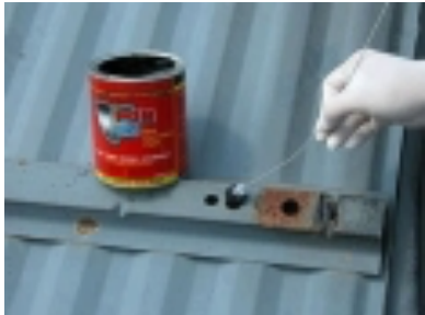
POR 15 DAUBER KITS- DK