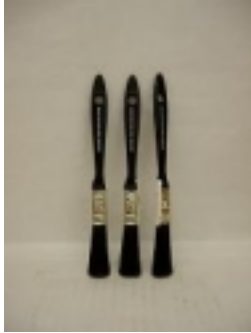
1/2" 100% Polyester Paint Brush -388710