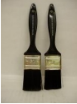
1-1/2" 100% Polyester Paint Brush 388-702