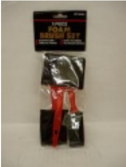
Package of 3 Foam Brushes Small, Med, Large 609-198